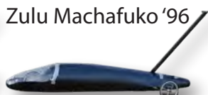
Zulu Machafuko '96