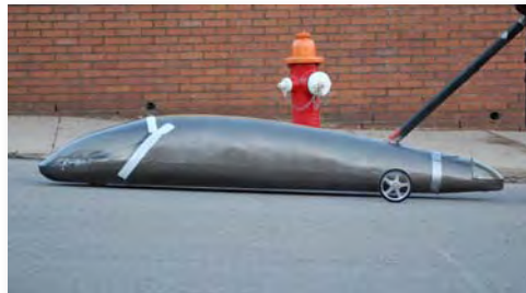
Spirit's Mapambazuko, a modern take on their design paradigm