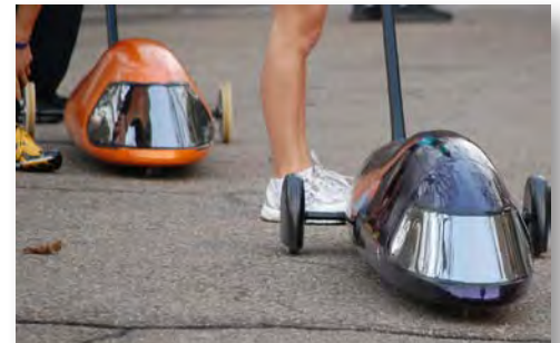
SDC's perennially fast standard trikes: Bane (front), Avarice (rear)