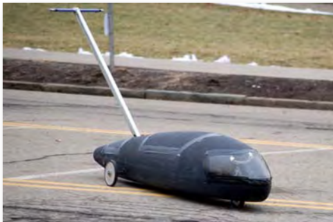
PiKA's new entry for 2011, their first standard trike in nearly 20 years

A few years ago in 2007, Spirit hadn't built in years and SDC had just finished their second reverse trike. By last year, even CIA had switched to the reverse format for its new buggy. Chatter on the course commonly assumed that standard trikes were the "old" design and reverse was happening as fast as orgs could get it together to switch. Here we are in 2011 and odds are that two of the top 3 finishers will cross the line with one wheel first. SDC's success with the standard design was evidently sufficient to tempt PiKA into experimenting, and it seems to have paid off. RD2011 has been consistently faster than their twin standard bearers Nemesis and Chimera. Is there a new trend towards the simpler-steering and power-slide dynamics of the standard trike, or are we seeing another instance of a long tradition of copying whoever is winning?